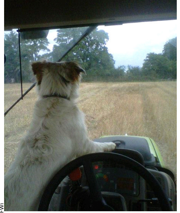
□ It's a dog's life!

A dog called Fred having a go at ploughing